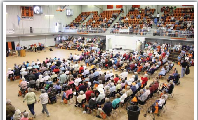
Members at 63rd Annual Meeting.