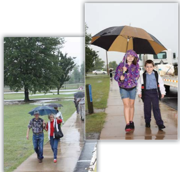
2012 Annual Meeting photos