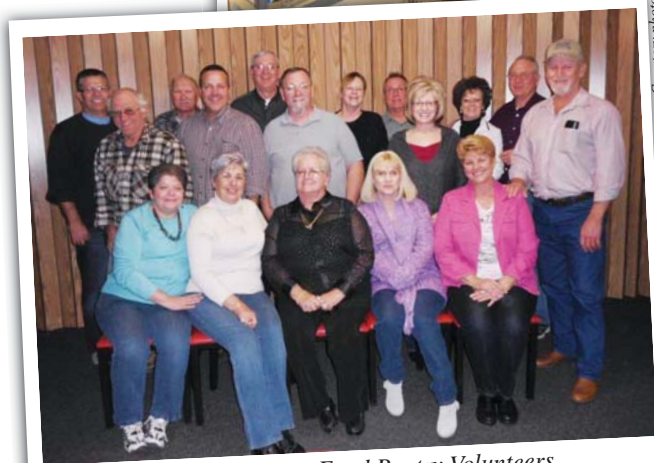
Joseph Project Community Food Pantry Volunteers