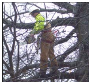
Contractor climbing tree.

Cookson Hills Electric Cooperative has contracted with Northeast Rural Utilities Services, a subsidiary of Northeast Oklahoma Electric Coop., Inc. out of Vinita, OK. They will begin cutting right-of-way in April. NRUS specializes in distribution, transmission and pipeline right-of-way maintenance. They will be operating a Kershaw Sky Trim and Hydroax. This unique equipment is designed to be operated in rough terrain. NRUS will also have a bucket truck with a wood chipper and a crew of three men. NRUS will begin west of Fin and Feather Resort near Lake Tenkiller.