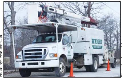
Wright Tree Service truck with chipper.