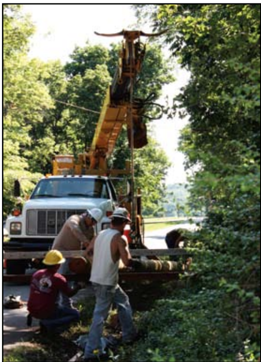
Winsett Electrical Contractors working in the Black Gum Area along Ridge Route Road.

In order to accommodate an increasing electric load, as well as provide improved reliability and power quality, Cookson Hills Electric Cooperative is upgrading facilities in the Black Gum Area along Ridge Route Road. This area is on the south side of Lake Tenkiller just east of the Tenkiller State Park.